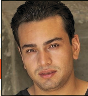
Frankie Delgado "The Hills"