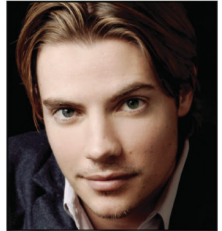
Josh Henderson "Desperate Housewives"