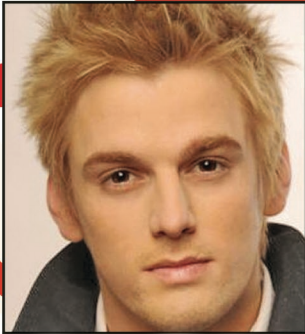
Aaron Carter "House of Carters"