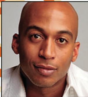
James Lesure "Las Vegas" • "Lipstick Jungle"