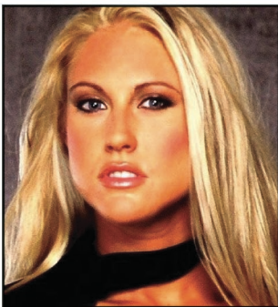
Venom "American Gladiators"