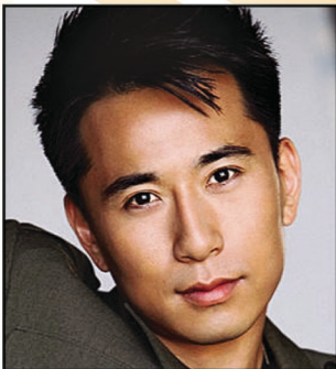
James Kyson Lee "Heroes"