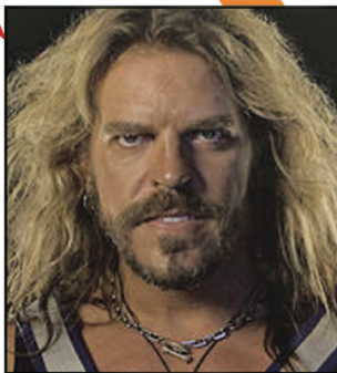
Wolf "American Gladiators"